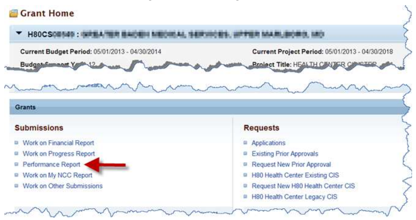
Figure 3: Grant Home Page

5. The Submissions – All page opens, displaying all performance reports related to the grant (Figure 4). To display only UDS reports, you can enter search parameters under Search Filters at the top of the page. For example, you can enter "UDS" in the Submission Name Like field, and then click Search .