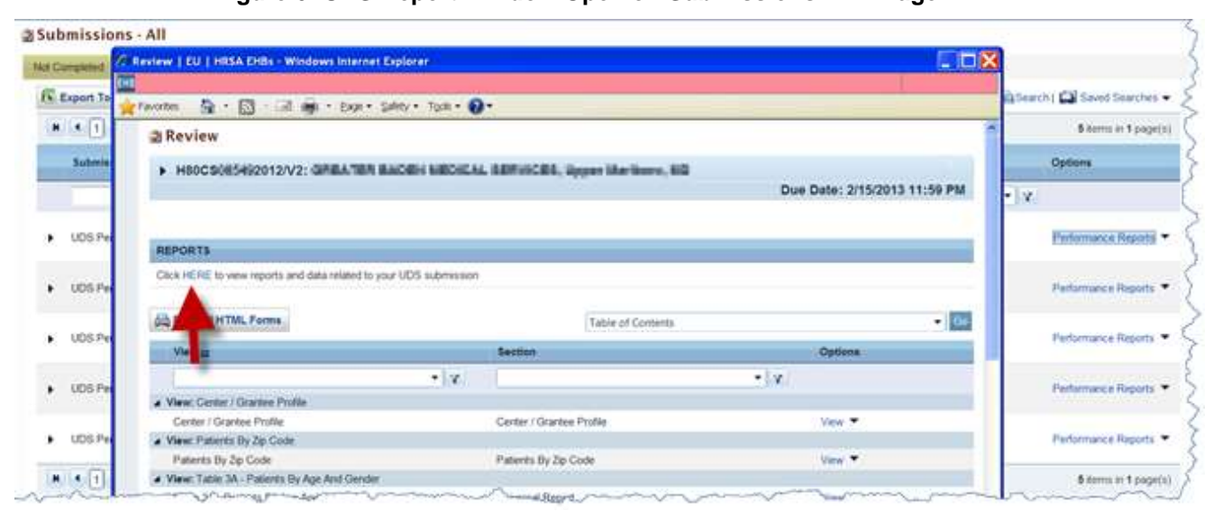
Figure 6: UDS Report Window Open on Submissions - All Page

The reports will open in a separate window (Figure 7).