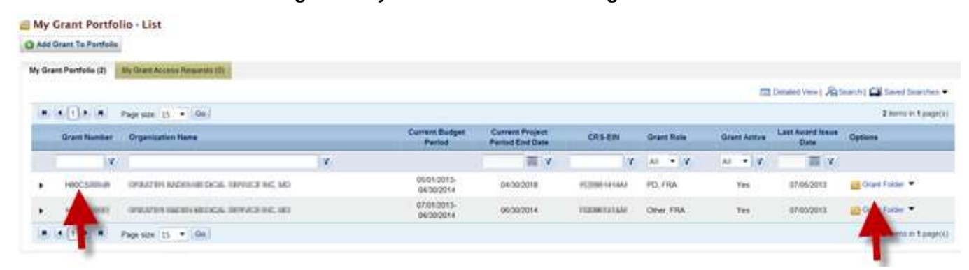
Figure 2: My Grant Portfolio - List Page

4. The Grant folder opens to the Grant Home page (Figure 3). In the Grants section of the page, under Submissions, click Performance Report .