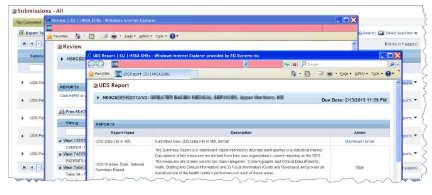
Figure 7: Standard UDS Reports Window