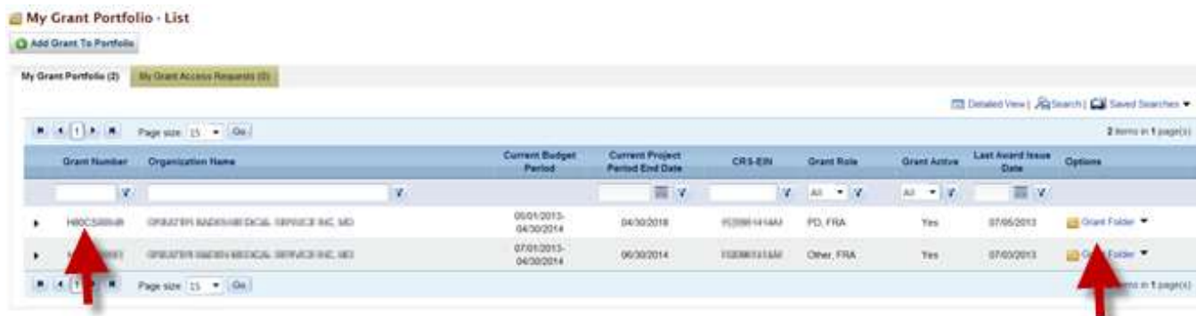
Figure 2: My Grant Portfolio – List Page