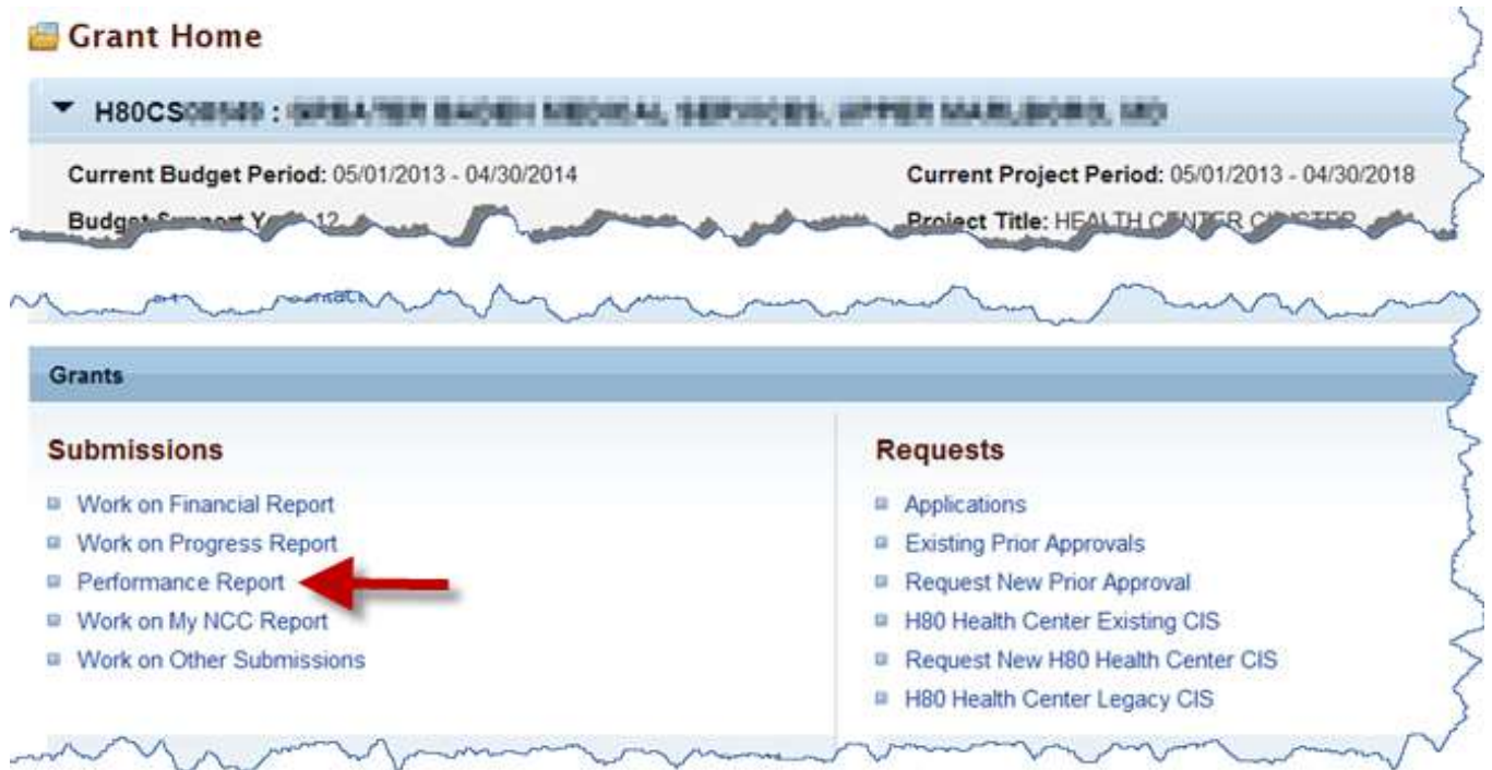
Figure 3: Grant Home Page