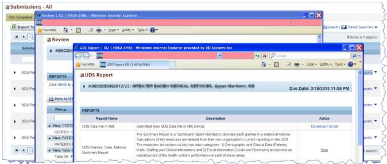
Figure 7: Standard UDS Reports Window