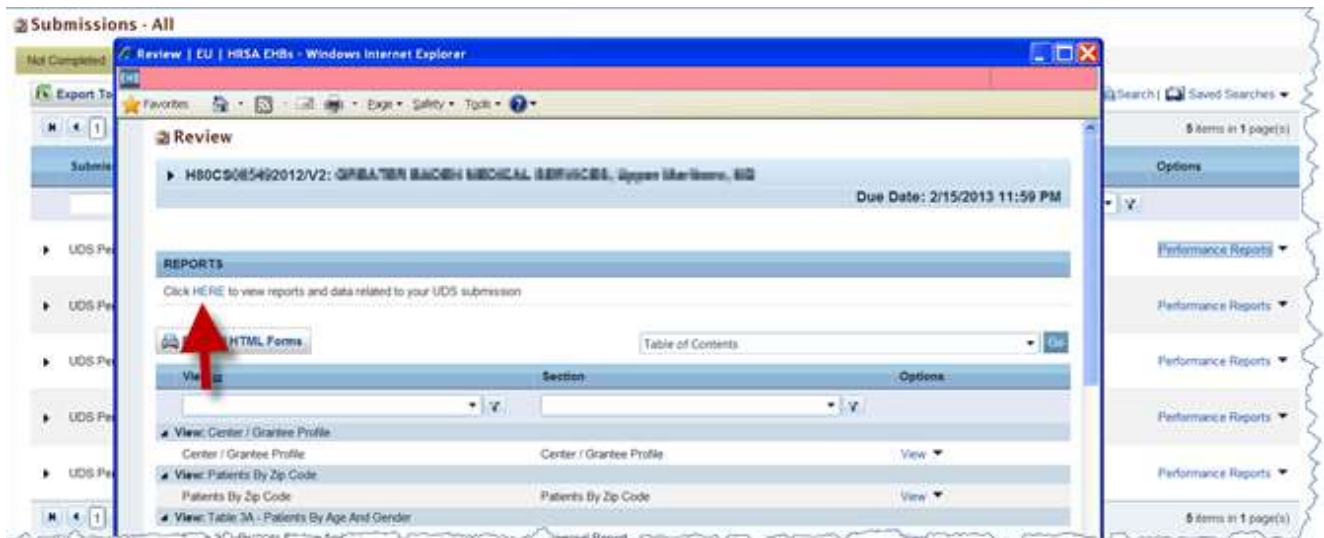
Figure 6: UDS Report Window Open on Submissions – All Page

The reports will open in a separate window (Figure 7).