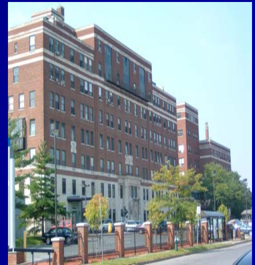
St. Peter's Hospital Albany, NY